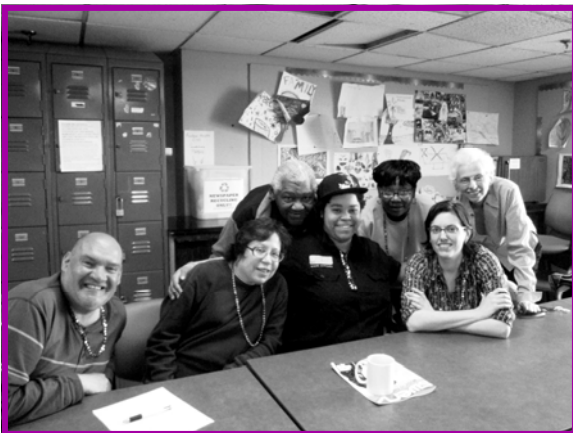
Introducing RHC's Hospitality Group!! Find out how to join every Tuesday at 3pm during the Fun Committee!

Would you like to get a visit from a member while you're in the hospital? Or maybe just a phone call from a caring friend would do the trick to bring a smile to your face? Well, over the past few months members of Rainbow Height's Club's member run Advisory Committee have been doing just that. In sharing how isolated some of them had felt at times in their lives where they really needed that extra encouragement, they realized they could provide that support to one another. And so began the RHC Hospitality Club.