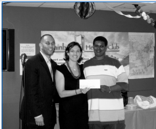
Above: NYS Assembly Member Hakeem Jeffries assists in drawing the raffle at this years Pride Open House, June 26th.

NY State Assembly Member Hakeem Jeffries visited the club during the Pride Open House. He announced that he has allocated $125,000 in the form of a capital project grant that will provide for some needed improvements in the Heights Hill Mental Health Service building. To help keep our members, staff and visitors safer we will be installing enhanced security cameras in the elevator lobbies and elevators. Our art room will be getting a makeover and we'll be getting new monitors for the computer room.