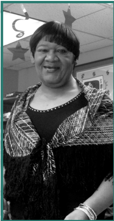
Featured: Members and staff who participated in Gender Day fun! Come out for our next day on May 22nd!